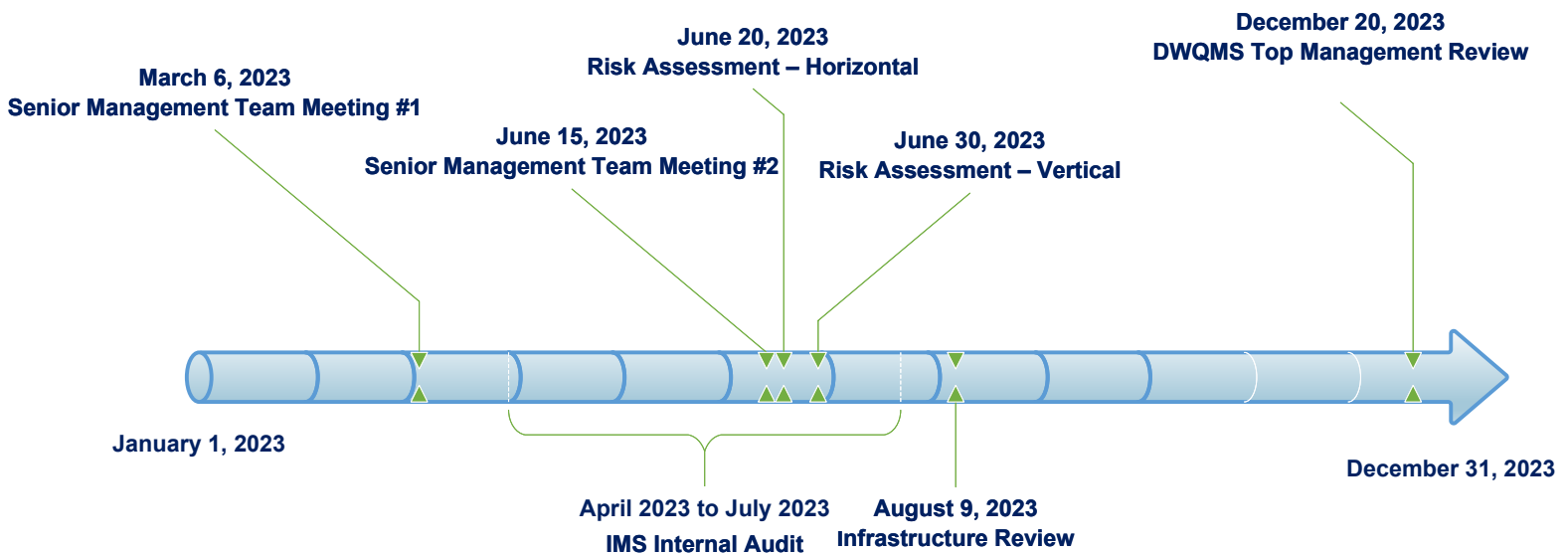
FIGURE 1: PROJECT PIPELINE - 2023 (KEY DWQMS MILESTONES WHICH OCCURRED IN 2023)