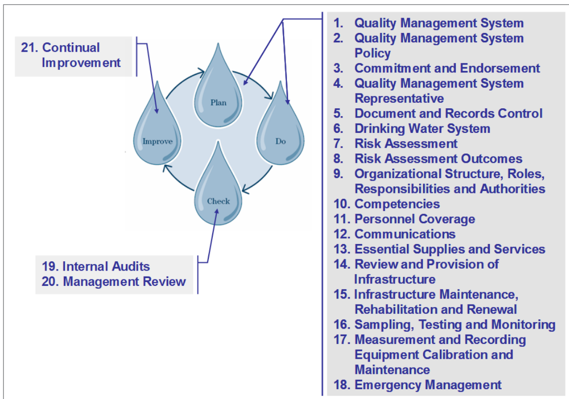
FIGURE 2: DWQMS STANDARD ELEMENTS

In addition, there were 11 approvals for extensions or replacements to the distribution system (i.e. Form 1), four minor modifications to the Drinking Water System (i.e. Form 2) and one Schedule C amendment.