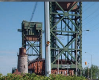
Lighthouse & Lift Bridge